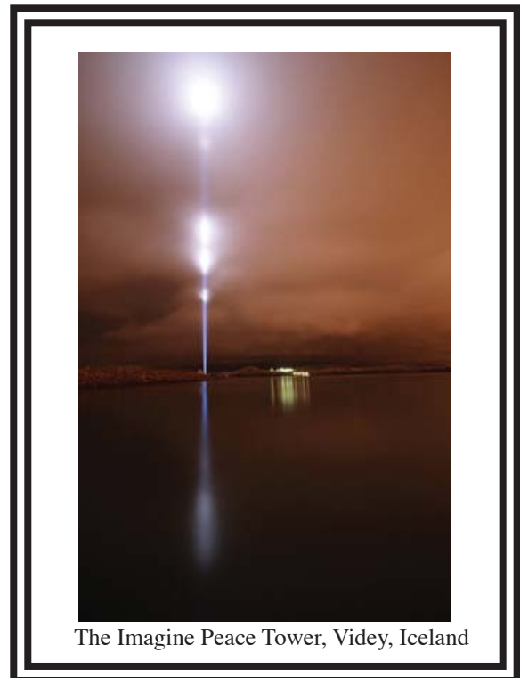
The Imagine Peace Tower, Videy, Iceland